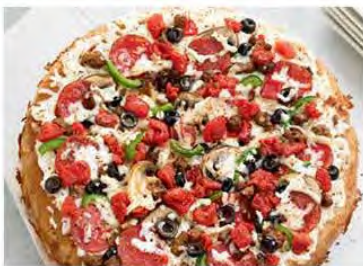
BJ's Favorite Deep Dish Pizza

Valid for dine in or take out. Not valid towards alcoholic beverages or Happy Hour specials. Please do not distribute flyers on-site during the event. Flyers must be printed and presented to the server.