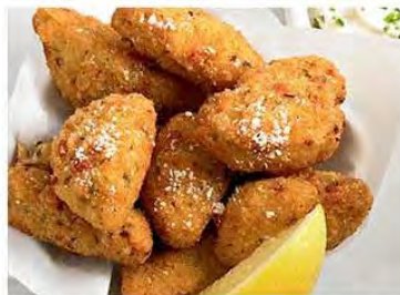
Crispy Fried Artichokes