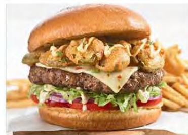
Crispy Jalapeño Burger