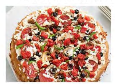
BJ's Favorite Deep Dish Pizza

Valid for dine in or take out. Not valid towards alcoholic beverages or Happy Hour specials. Please do not distribute flyers on-site during the event. Flyers must be printed and presented to the server.