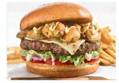
Crispy Jalapeño Burger