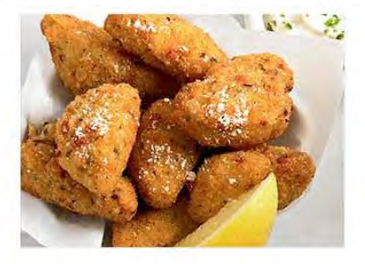
Crispy Fried Artichokes